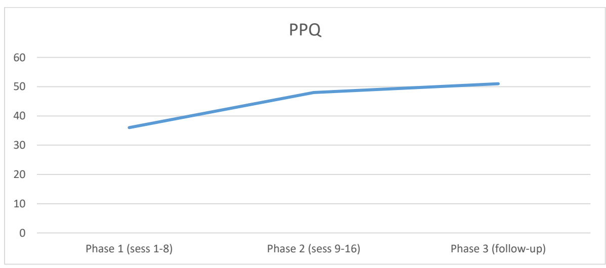
Figure 3: Severity of client's perceived suffering across the three phases of the therapy (PPQ)